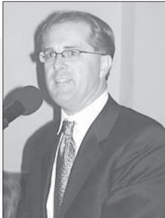
Kansas Attorney General Phill Kline pressed for harsher penalties during the press conference.