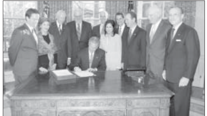
President Bush signs the "Violence Against Women and Department of Justice Reauthorization Act of 2005" on January 5, 2006. The Act creates the first federal funding stream dedicated to direct services for victims of sexual assault.

VAWA 2005 also includes the re-authorization of the rape prevention and education programs and the grants to combat violence on college campuses.