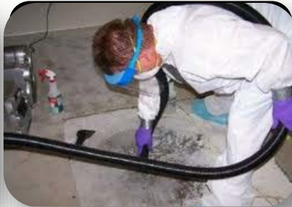
Crime Scene Clean-up