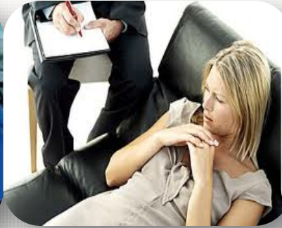
Mental Health Counseling